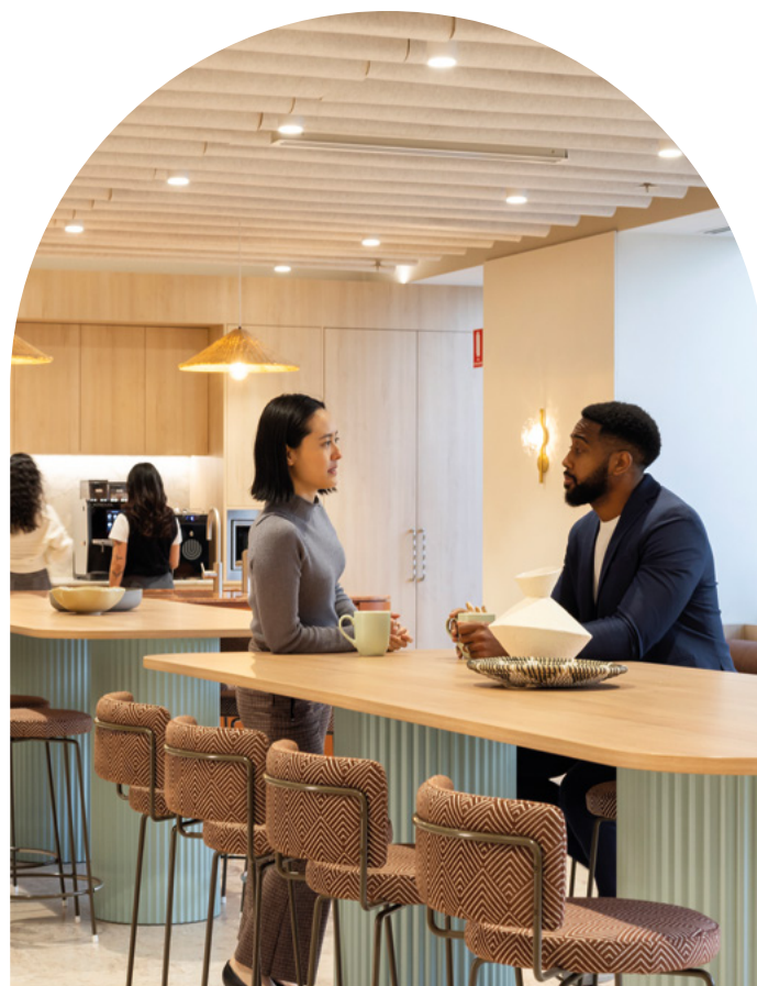
GPT Space&Co, Darling Park, Sydney