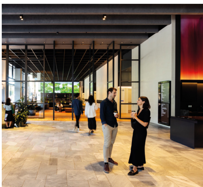
2 Southbank Boulevard, Melbourne