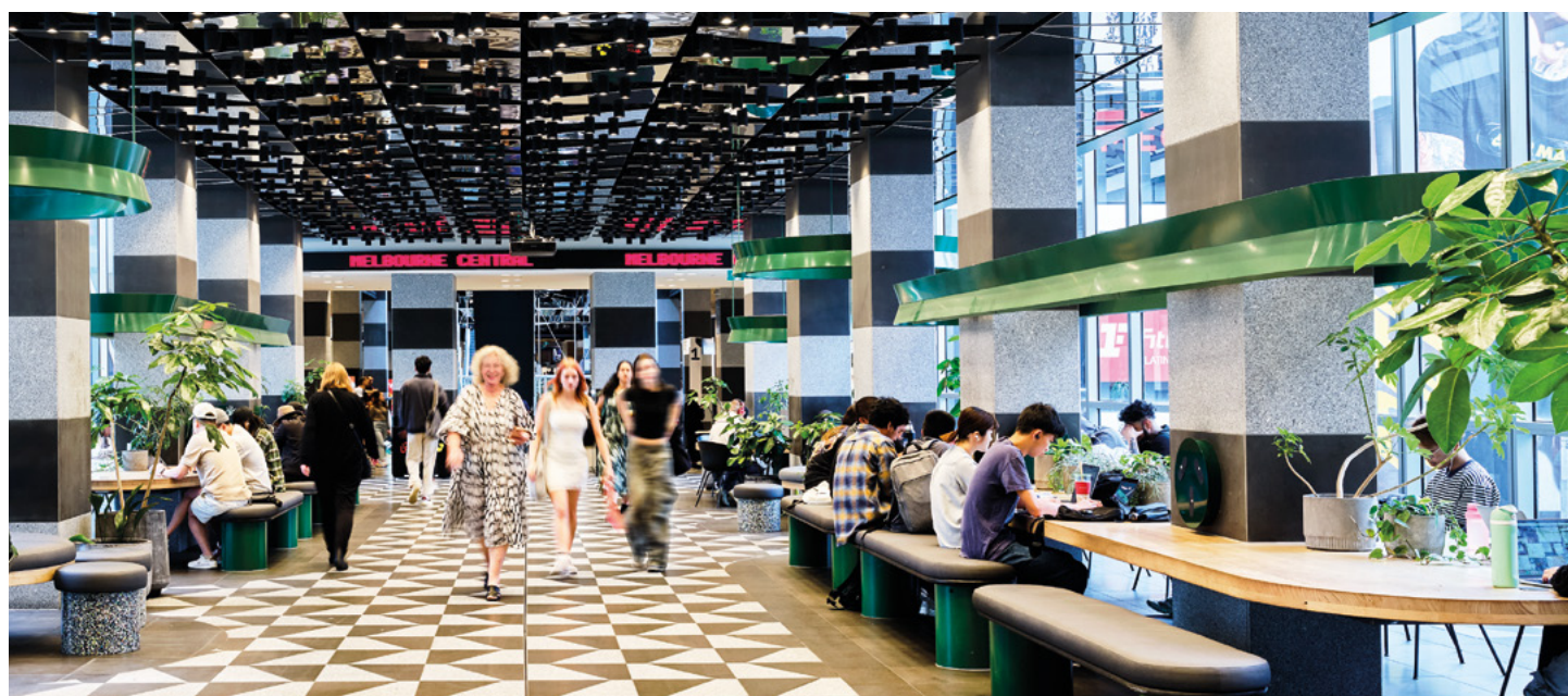
Melbourne Central, Melbourne

Securityholders may also submit written questions to the Auditor relevant to the content of the audit report for the Company or the conduct of the audit for the Company using the methods listed on page 07 under the heading 'Submitting written questions in advance of the Meeting'. A list of those relevant written questions submitted to the Auditor will be made available to Securityholders who attend the Meeting. The Auditor will either answer the questions at the Meeting or table written answers to them at the Meeting. If written answers are tabled at the Meeting, they will be made available to Securityholders as soon as practicable after the Meeting.