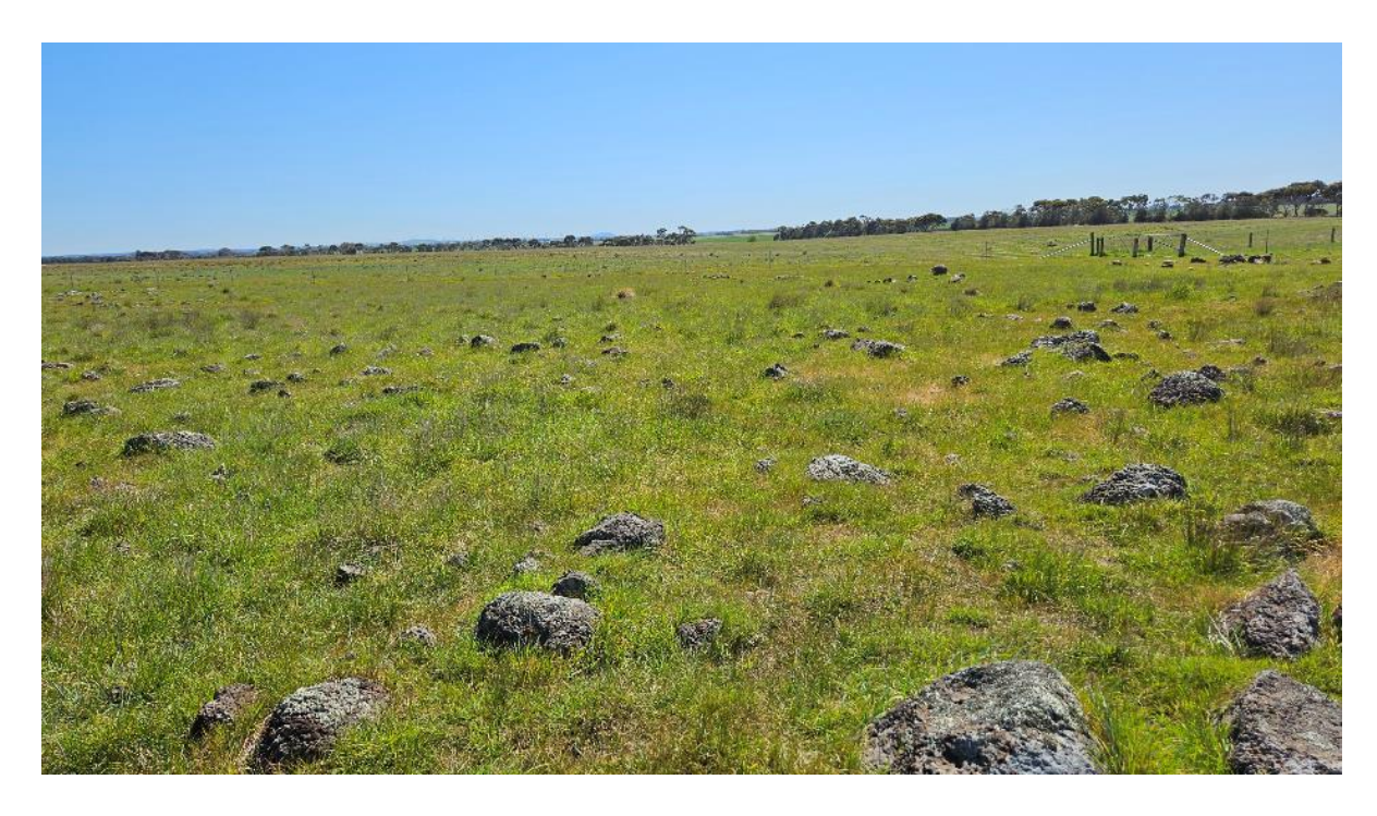
Plate 2. The northern paddock, exhibiting high cover of native vegetation (11 October 2023).