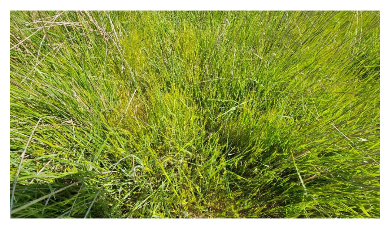
Plate 4 . Squirrel-tailed Fescue, an annual grass, dominating inter-tussock space within the southern paddock (30 May 2023).