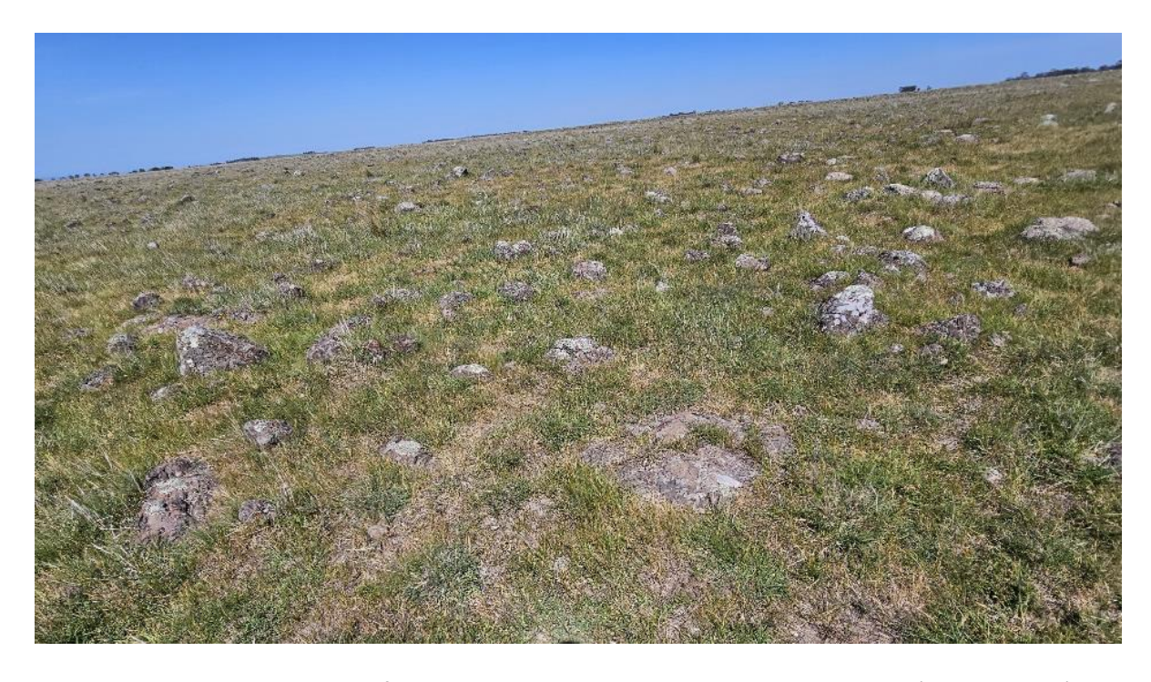
Plate 6. A lower presence of biomass observed within the northern paddock (30 May 2023).