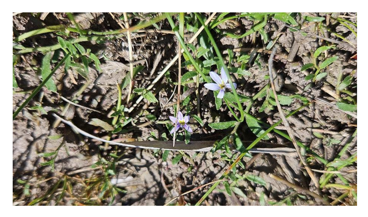
Plate 5 . Swamp Isotome, one of several forbs observed occurring within inter-tussock space in the northern paddock (30 May 2023).