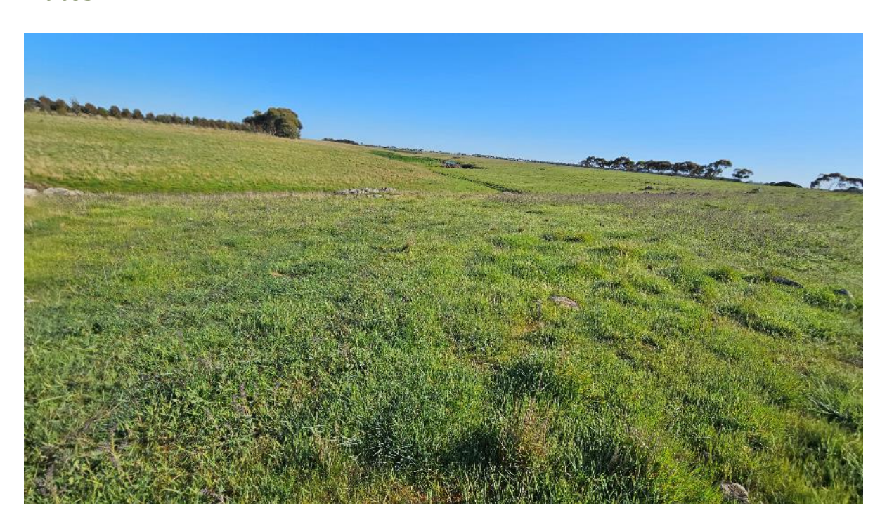
Plate 1 . The southern paddock, exhibiting some native and some exotic vegetation (11 October 2023).