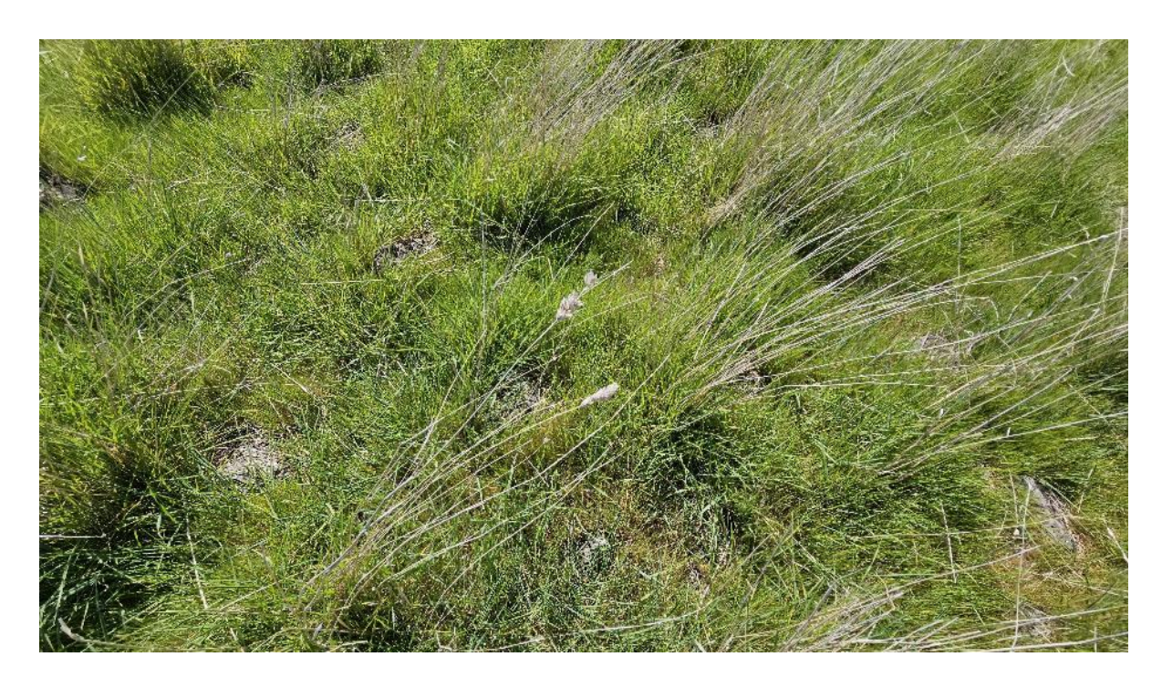
Plate 3. Toowoomba Canary-grass occurring in the southern paddock (11 October 2023).