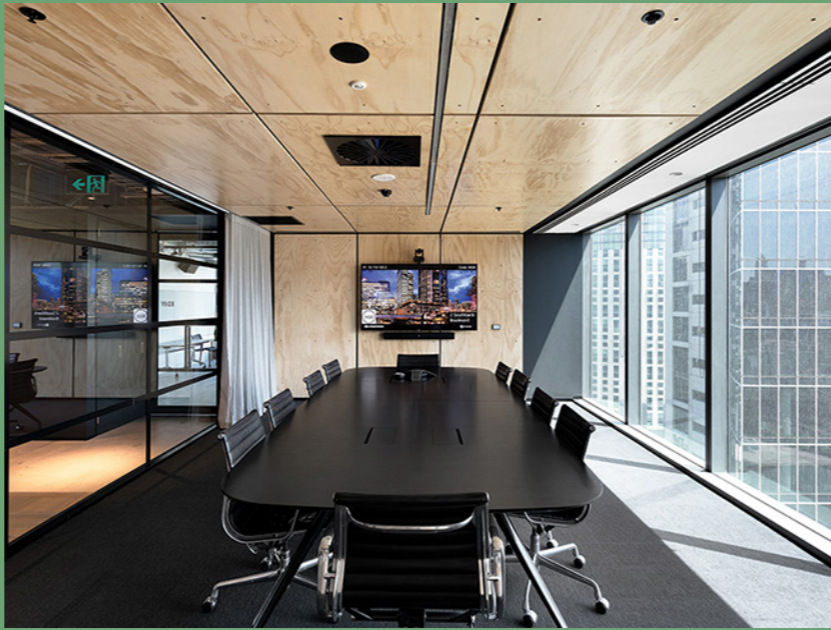
The Boardroom | 19.02