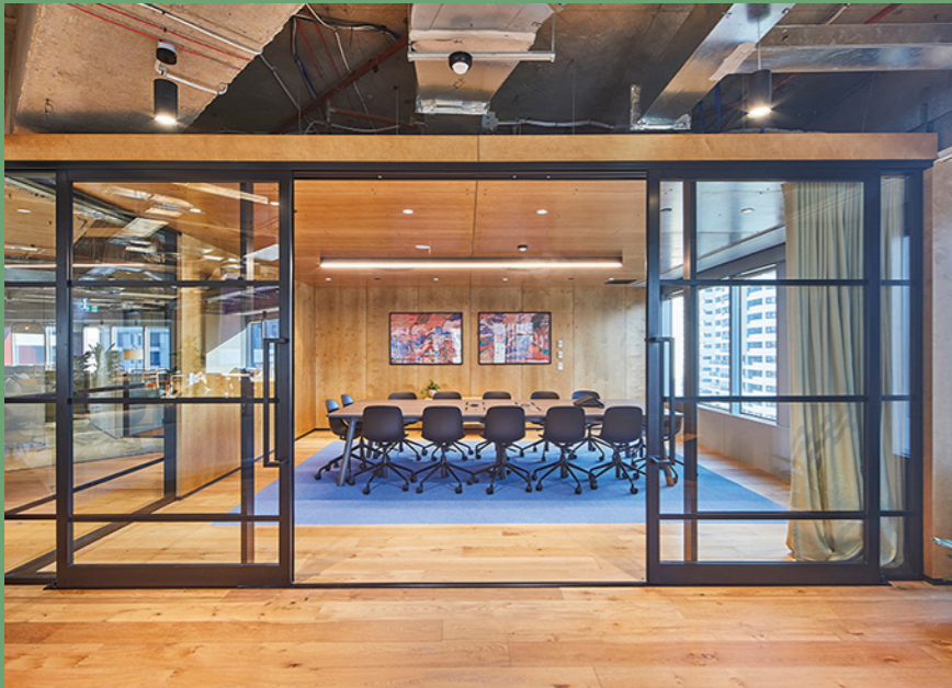
The Boardroom | 10.01