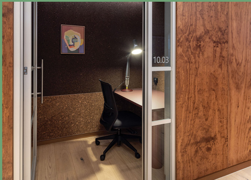
1 Person Focus Room