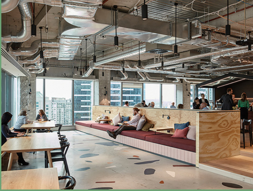
The Sunken Lounge