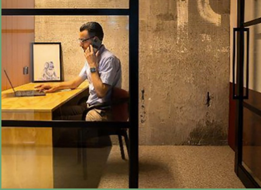
1 Person Focus Room