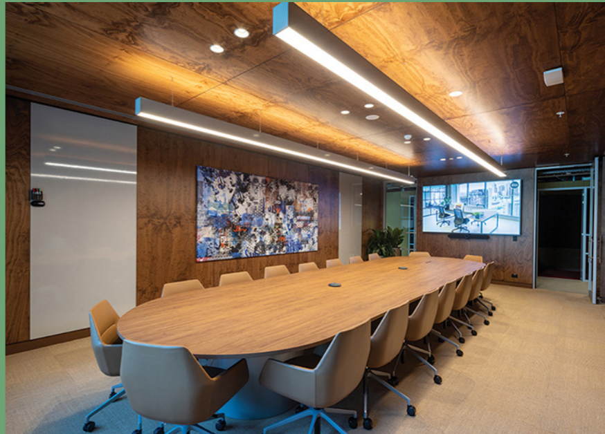
Jagger | 10.09