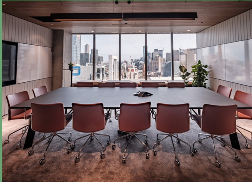
The Boardroom | 22.02