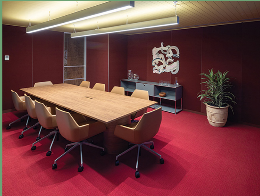
Richards | 10.07