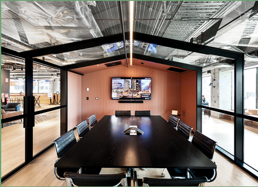
The Glasshouse | 19.01