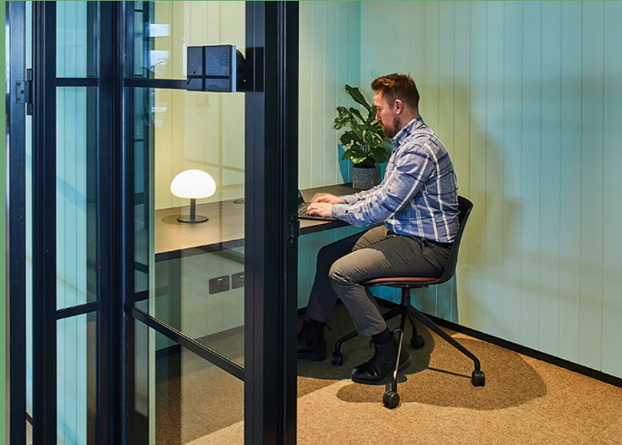
1 Person Focus Room