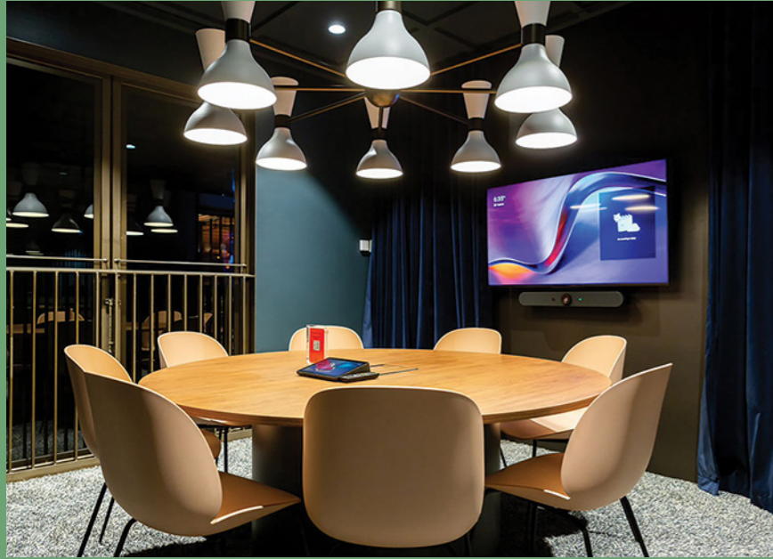
Rapture | 2.07