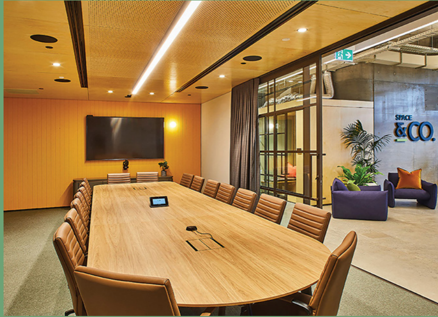
Burra Boardroom | 2.01