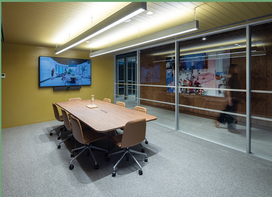
Fleetwood | 11.14