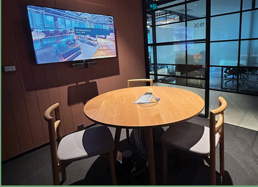
The Boulevard | 19.06