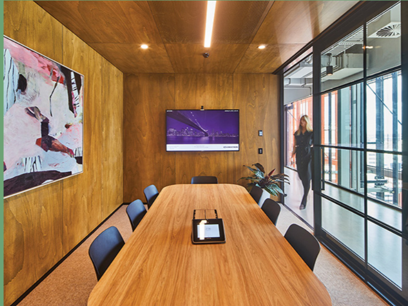
Boardroom | 14.02