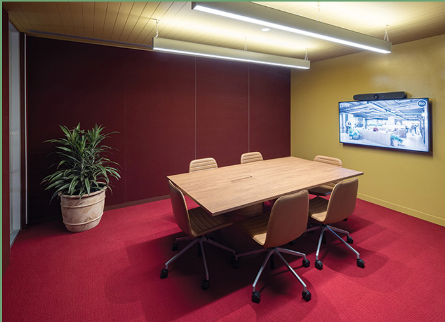
Watts | 10.06