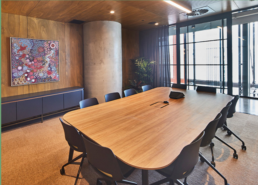
Boardroom | 14.01