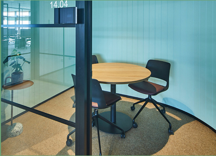
4 Person Focus Room